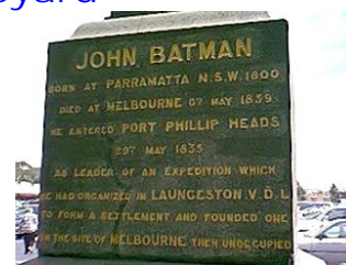
Last gravestone in car park today