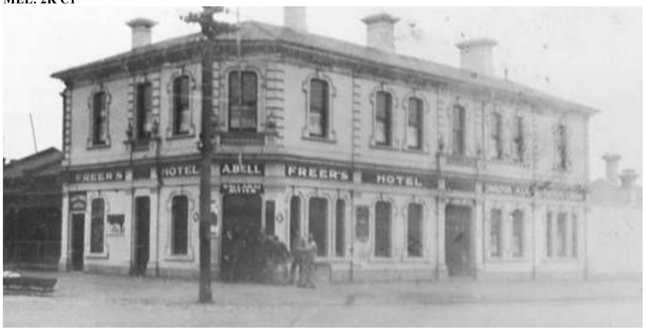
Freer's Family Hotel, c.1880

Bell's Hotel, Freer's Family Hotel 1874 -209 Clarendon Street, corner York Street, South Melbourne MEL: 2K C1