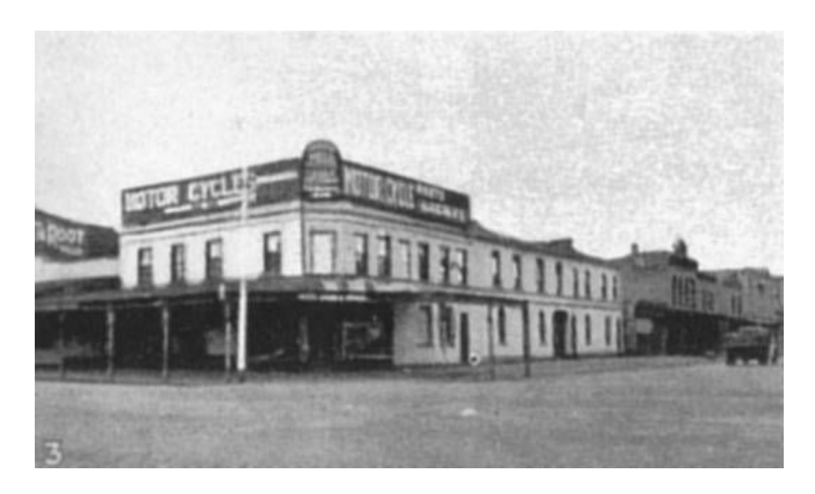
Site of Hit or Miss Hotel, 1940

206-212 Clarendon Street, corner York Street, South Melbourne MEL: 2K C1