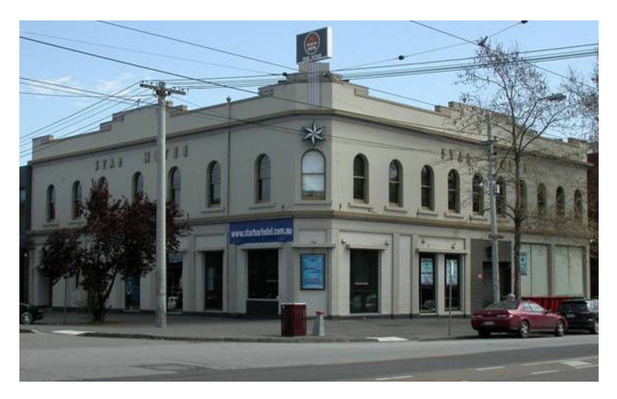
Star Hotel, 2004

160 Clarendon Street, corner Market Street, South Melbourne MEL: 2F C12